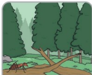
inside rotting wood