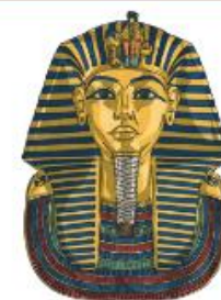
Tutankhamun's death mask

The discovery helped people to understand more about the Egyptians pharaohs .