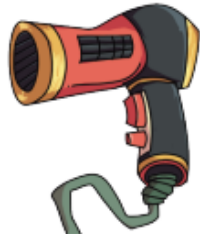
push button switch